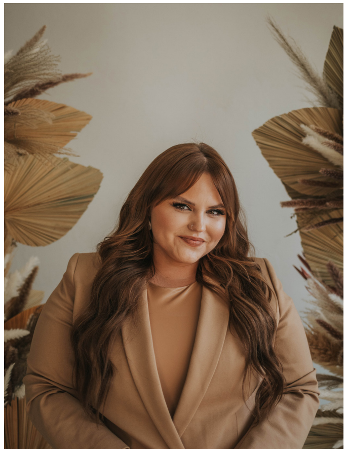
By: Allyssa Beauty Bar